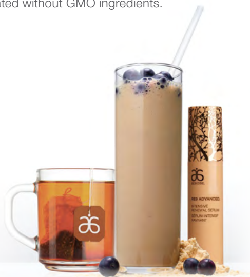
Pairing Arbonne Essentials. nutrition products with Arbonne skincare makes this simple.

NUTRITIONAL ADVANTAGE: Plant powered, nutrient rich products that are cleaner for better results, following a strict ingredient policy that is always gluten free, vegan and formulated without GMO ingredients.